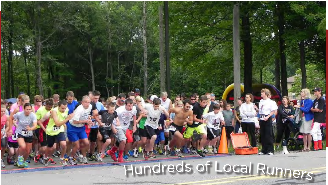
Hundreds of Local Runners

COURSE: 5K Run/Walk through scenic Roaring Brook/Elmhurst. Some short uphill and downhill grades. 3.1 miles total. For a detailed interactive map visit www.steulalia5k.com .